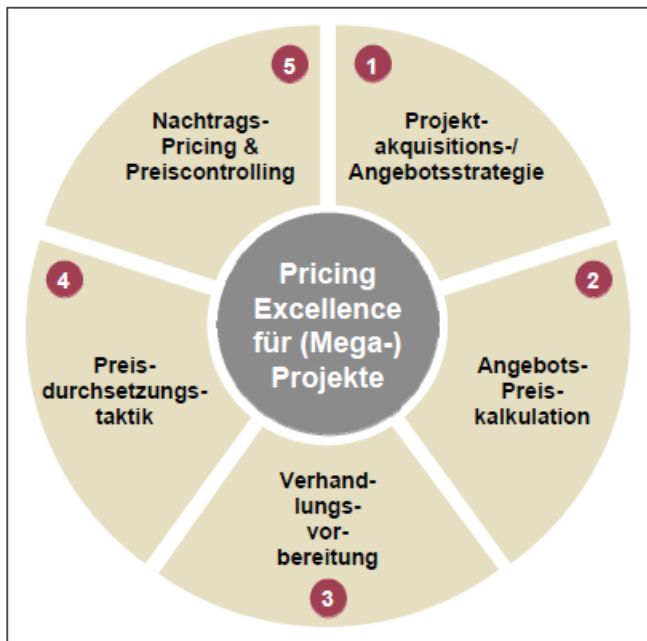
Abbildung 1: Pricing Excellence-Ansatz für (Mega-)Projekte

This graphic is clear, structured and reduced to one colour scheme. You could provide an illustration in a similar form to your article.